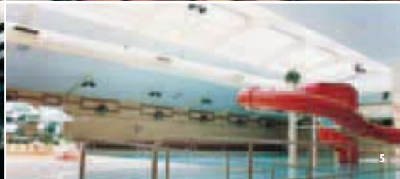
5: Waveney Valley Pool Bungay Recreation Application