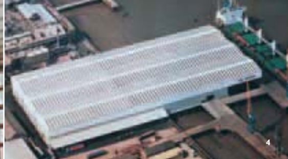
4: Tower Wharf Complex Kent Warehouse Application