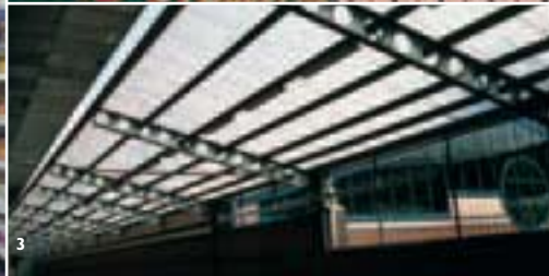
3: North Kensington Amenity Trust London Recreation Application