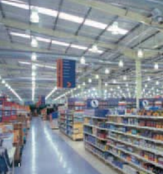
1: Big W Store Bolton Retail Application