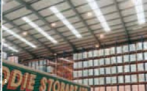
2: Eddie Stobart Daventry Warehouse Application