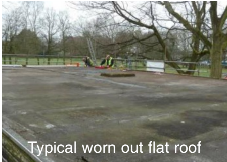
Typical worn out flat roof

One simple section using the hand operated site cropping tool for fast, simple flat to pitch roof structures