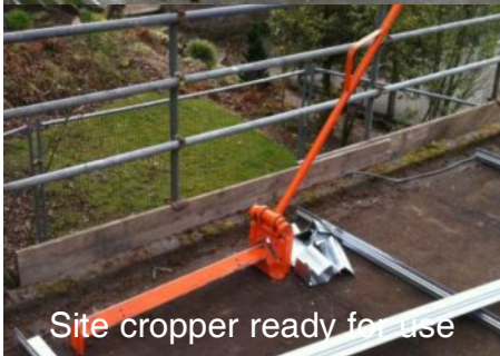
Site cropper ready for use