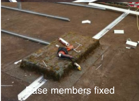
Base members fixed