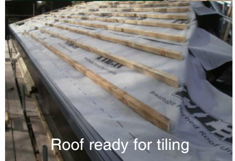
Roof ready for tiling

ROframe ® is a new exciting product for the flat to pitch conversion market.