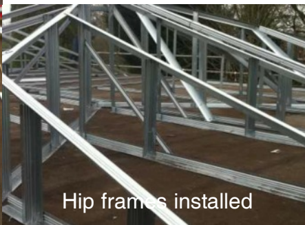
Hip frames installed