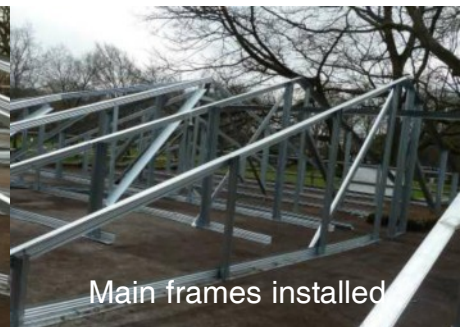
Main frames installed